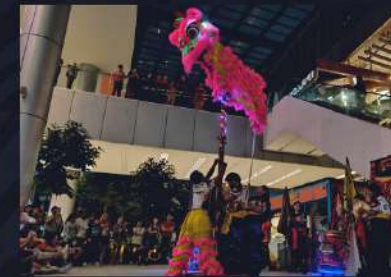
LION DANCE ON THE HIGH POLE SINGLE