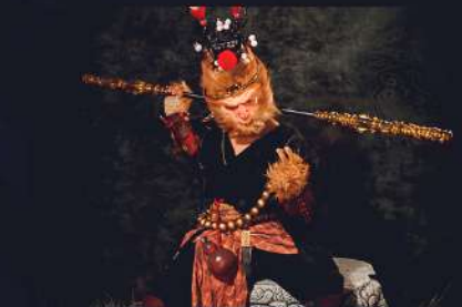
LIVING MONKEY KING