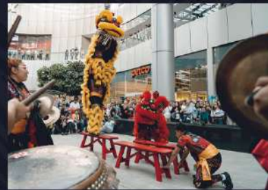
CHINESE LION DANCE ON THE BENCHES