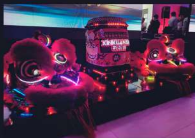
IMPERIAL EXHIBITION (VISUAL)