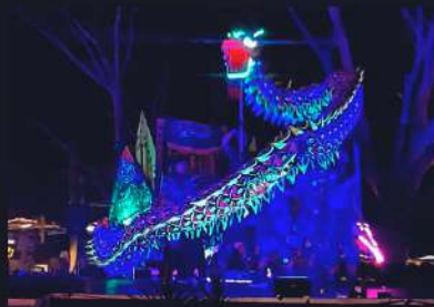
LUMINOUS LEDS DRAGON DANCE