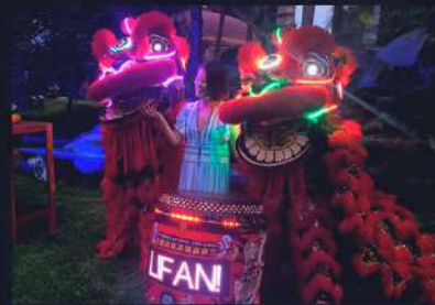
CHINESE LION DANCE WITH LED LIGHT