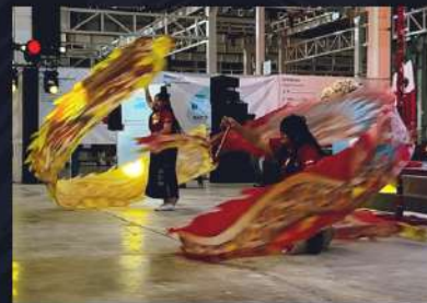
DRAGON RIBBON DANCE