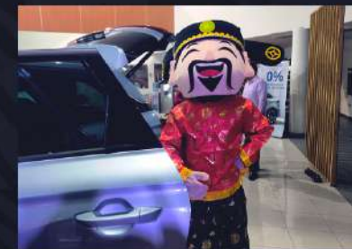
GOD OF FORTUNE (AUSPICIOUS MASCOT)