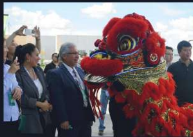
CHINESE LION DANCE ON THE FLOOR