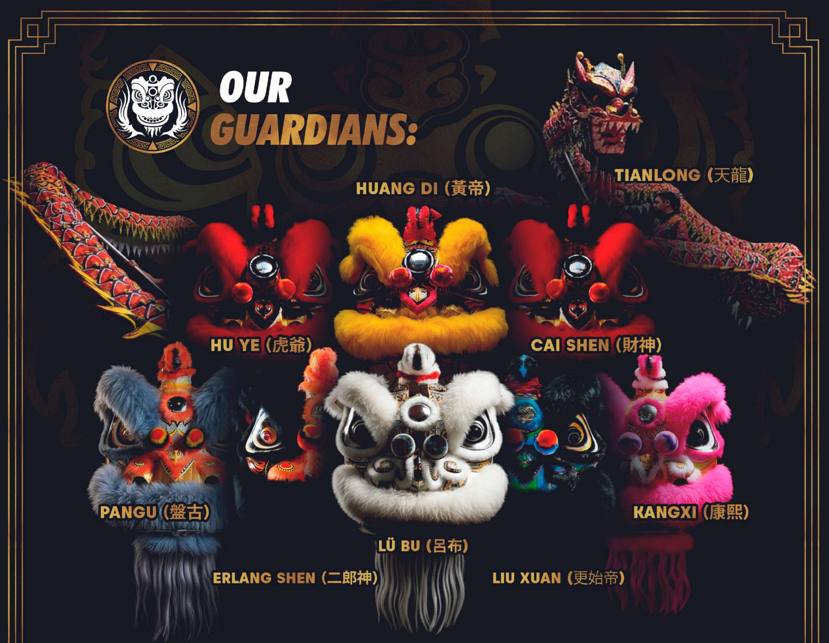
LIU XUAN (更始帝)