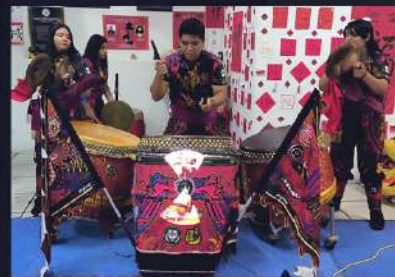
WAR DRUMS SHOW