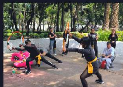
CHINESE LION DANCE WORKSHOPS

*The performance is supported by creative staff and practitioners of traditional dance, with the aim of providing an adequate service to meet your needs, creating an impressive show for your event or activation.