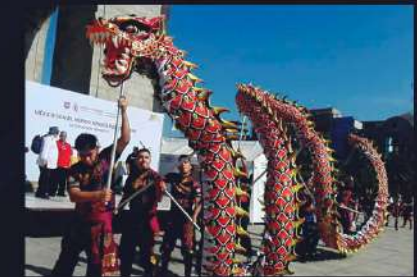
CHINESE DRAGON DANCE